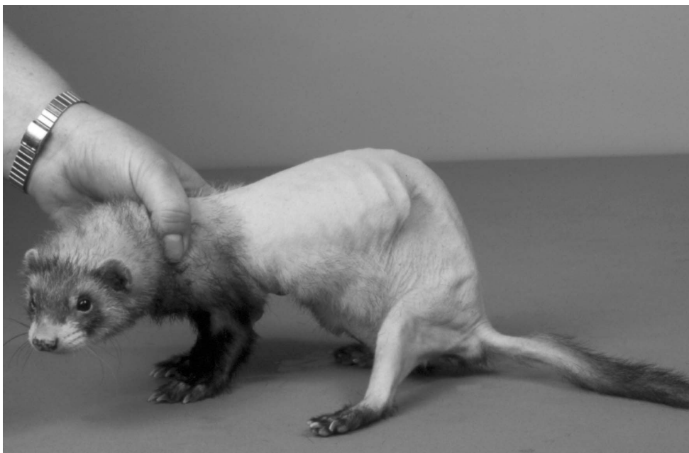
Figure 1. Symmetrical alopecia in a ferret with hyperadrenocorticism

The most prominent, and initially seasonal, symptoms of hyperadrenocorticism in ferrets are symmetrical alopecia (Fig. 1), vulvar swelling in neutered jills, and recurrence of sexual behavior in neutered males. 15 There is no sex predilection. 18 The diagnosis is based upon increased plasma concentrations of androstenedione, 17 \alpha -hydroxyprogesterone, dehydroepiandrosterone sulfate, and/or estradiol. In contrast plasma concentrations of cortisol are increased in a minority of cases. 16 Measurement of urinary corticoid/creatinine ratios 4 and ultrasonography of the adrenals 15 may contribute to the diagnosis. In approximately 85% of ferrets with hyperadrenocorticism only one adrenal gland is enlarged, without atrophy of the contralateral adrenal gland, and in the remaining 15% there is bilateral involvement. 17,24 After unilateral adrenalectomy there may be recurrence of the disease due to enlargement of the contralateral adrenal gland. 24 The histologic changes of the adrenals range from (nodular) hyperplasia to adenoma and adenocarcinoma. 17,24